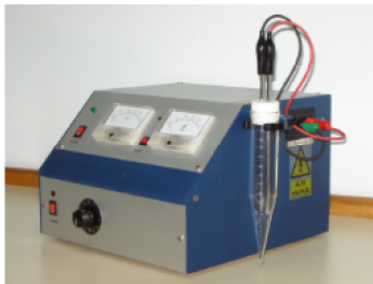
COMMERCIAL MODEL M3 WITHOUT PROTECTOR.

The current 3rd generation equipment uses a DC half-wave with a maximum of 1,000 Volts. It features a security system that reduces the voltage when the intensity increases beyond a threshold. Voltage and intensity analog dials (VU meters) allow a continuous monitoring of the process. The equipment usually gives a good estimate of the formulation performance within 15 minutes.