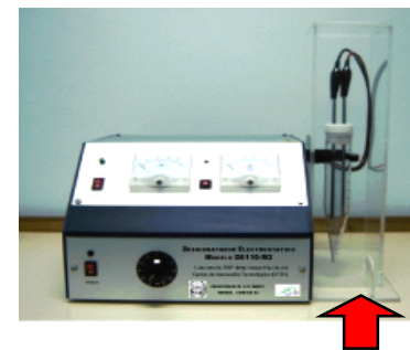
DE-110-M3 WITH HIGH VOLTAGE PROTECTOR

Optional versions (built on demand) could be connected to a Wintel PC fitted with a data acquisition card to carry the operation and processing through a Labview® program.