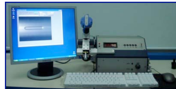
Tensiometer and PC setting